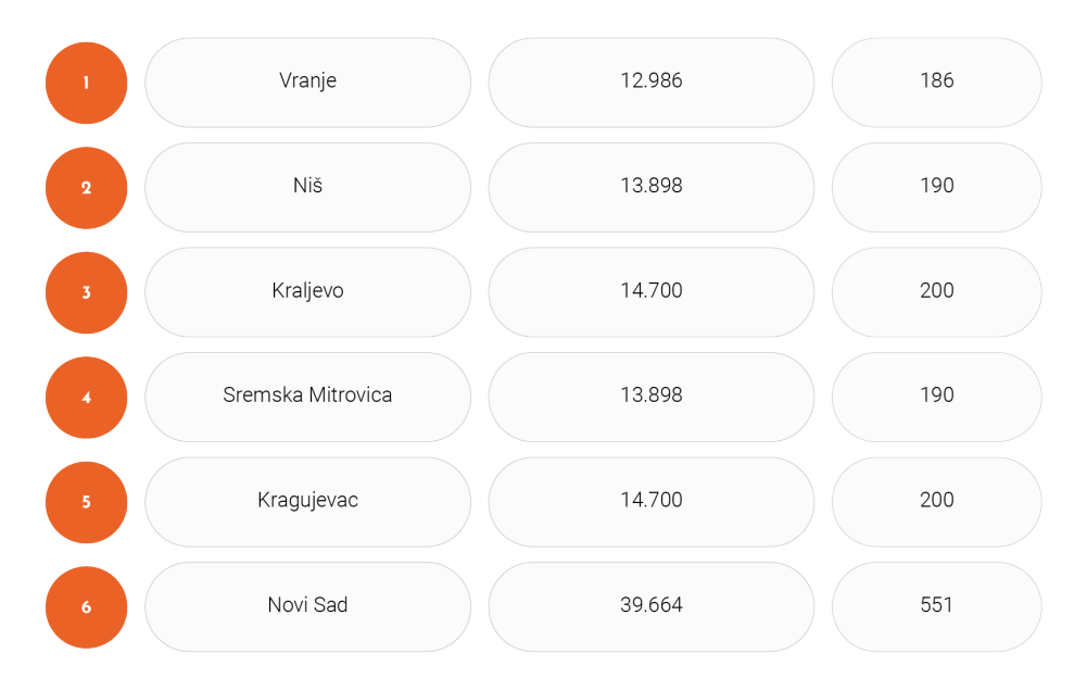
<u>Table 1</u> Area and number of apartments by city – Phase I

According to information from the tender documentation, the phase that was designated as "Phase I" projected construction at six sites, amounting to 1,517 apartments and totalling 109,846m<sup>2</sup>.